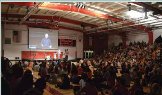
Speaking at Biola University about the power of simple prayer.

What joy to be partakers with multiple audiences in one day who were encouraged to embrace our "Glory Days." See more on "Our Day with Max Lucado" at our website.