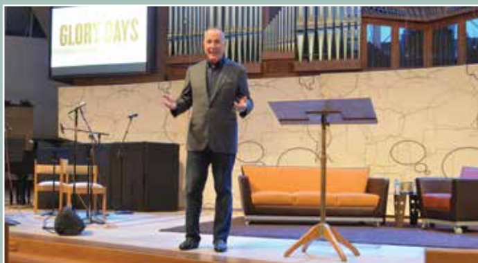
At St. Andrew's, Max gives a powerful vision for what it looks like to be a person who's living your promised land life—now!