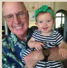
Max Lucado (UpWords)