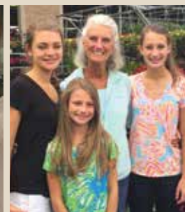
Anne Graham Lotz (AnGeL Ministries)