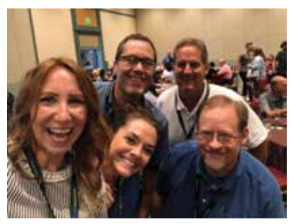
West coast meets upper-Midwest with the teams from WCSG and KTIS.