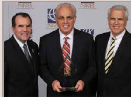
NRB's most prestigious award is presented for invaluable contribution to the field of Christian communications.