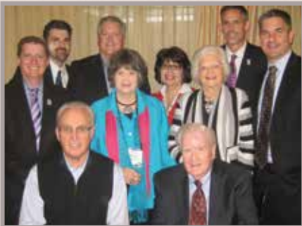
Pictured here at NRB, the Ambassador and Grace to You teams, who have enjoyed nearly 30 years of relationship.

I think what keeps me going with all my ministries is my love for the Truth and any opportunity or avenue that I have to proclaim the Truth. It compels me because the Truth compels me—the truth of the Word of God.