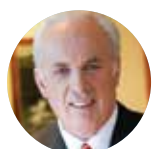
John MacArthur Grace to You