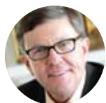
Dennis Rainey FamilyLife Today