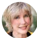
Joni Eareckson Tada Joni and Friends