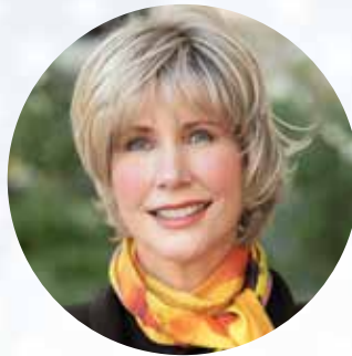
Joni Eareckson Tada