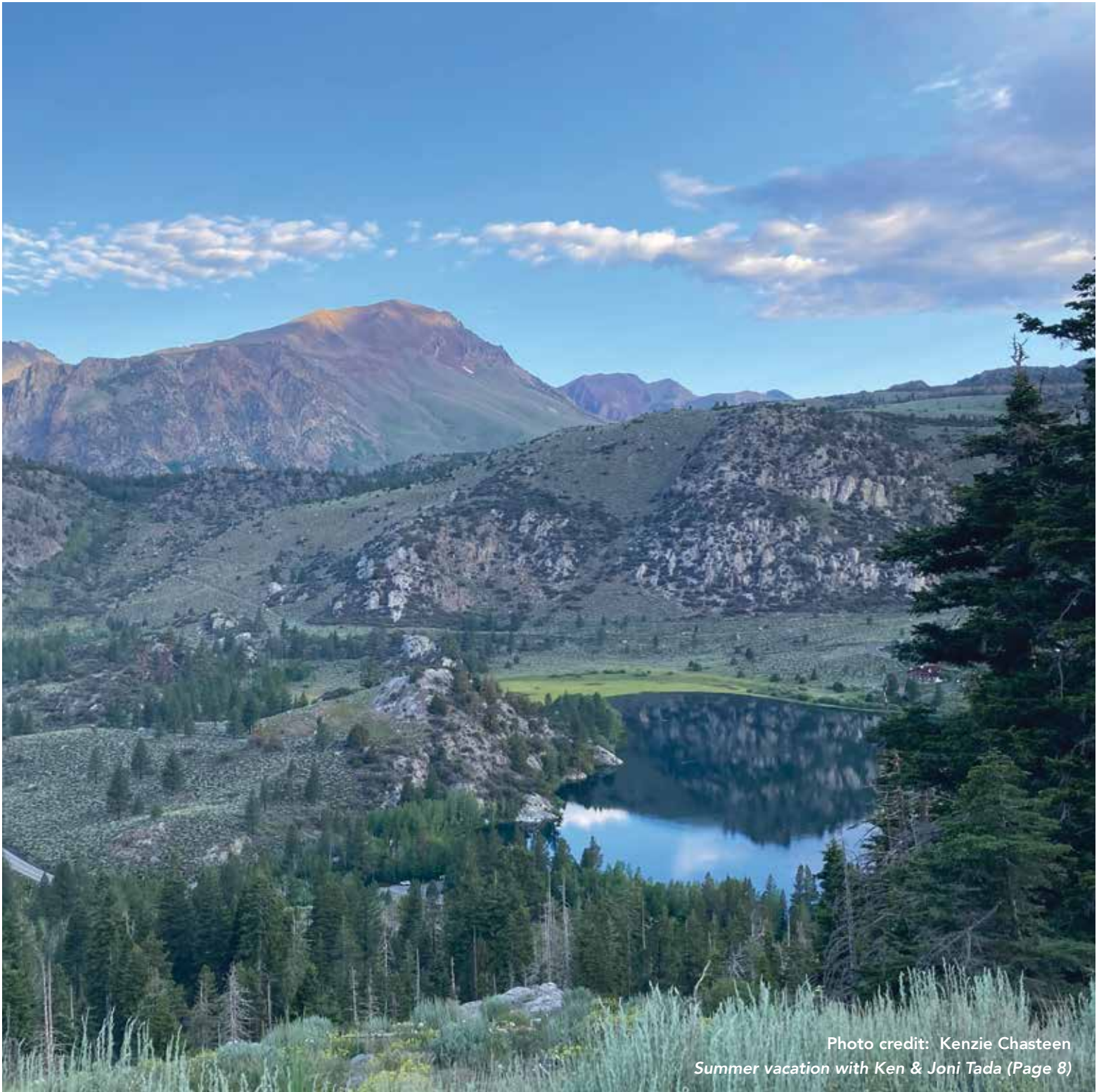
Summer vacation with Ken & Joni Tada (Page 8)