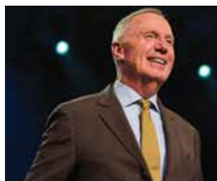
Max Lucado Oak Hills Church San Antonio TX Leading since 1988 Heard daily on Upwords