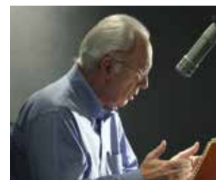
John MacArthur Grace Community Church Panorama City CA Began at Grace in 1969 Heard daily on Grace to You ; Portraits of Grace ; Bible Q&A

This month we salute those who lead us as shepherds in the local church—that includes these favorites who we’re privileged to serve and who continue to lead congregations in addition to outreach beyond the church.