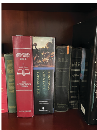
Various translations of the Bible . . .