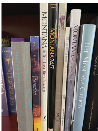
Books on my home state of Montana . . .

I organize my books by category and four of my favorite categories are: