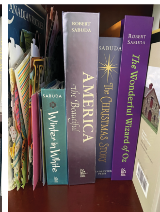
and, as a bonus, I have a sweet spot for pop-up books. "