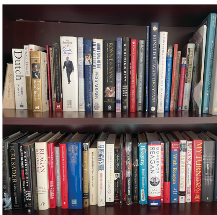
A "mini" library on Ronald Reagan . . .