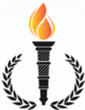
THE BOOK Impacting the 2016 Olympic Games