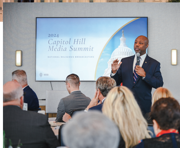
Senator Tim Scott, one of four Senators speaking to the Summit, encourages attendees on the important work of NRB in the Capitol.

Don't miss out next year ... join the President's Council now and enjoy special fellowship at NRB as well as these significant convenings. Go to the NRB website to sign up!