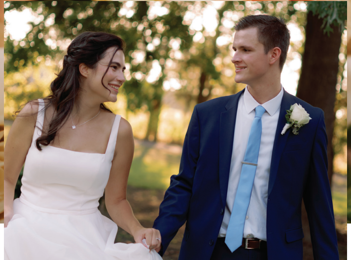
The happy couple! 😊