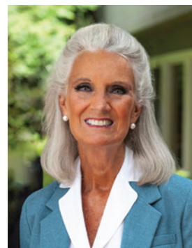
Anne Graham Lotz

The choice is ours. What will it be? Will we return to our faith in God? Or will we continue in rebellion against Him on a path that leads to our destruction? If every American's choice is a reflection of yours, will we as a nation navigate our way out of the destructive course we are on? Join me as together we listen to and heed God's Word, renew our faith in Him as we reset our compass, then follow His direction seeking to live a life that receives His blessing.